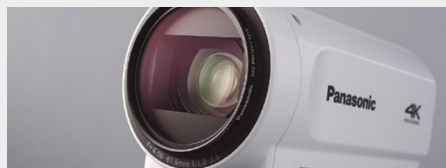
Lens Protector (Standard Equipment)