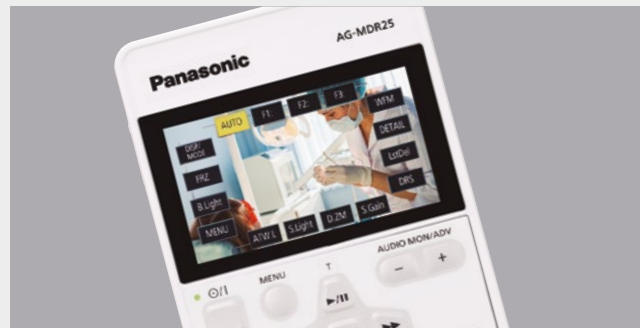
Touch Panel LCD (User Button Setting Example)