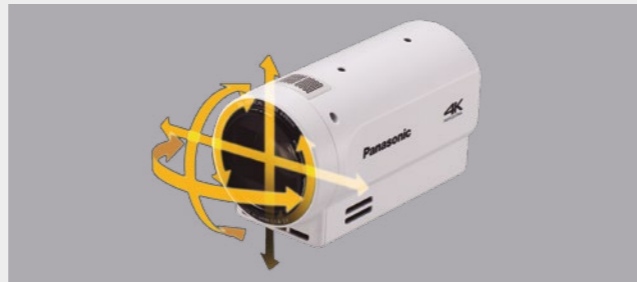
Five-Axis Hybrid Image Stabilizer Diagram