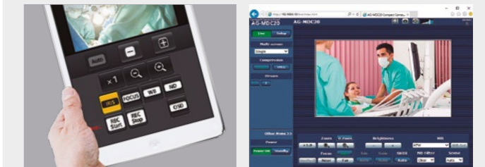
IP Control (Tablet Screen Example)